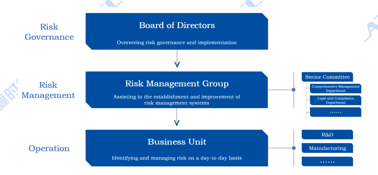
CATL Risk Governance Structure

• Third line of defence: The Company's internal audit department is responsible for providing independent and objective audits and reviews on the effectiveness of significant risk management and internal control, and directly reports to the Board of Directors to ensure the objectivity, authority and credibility of internal audit results.